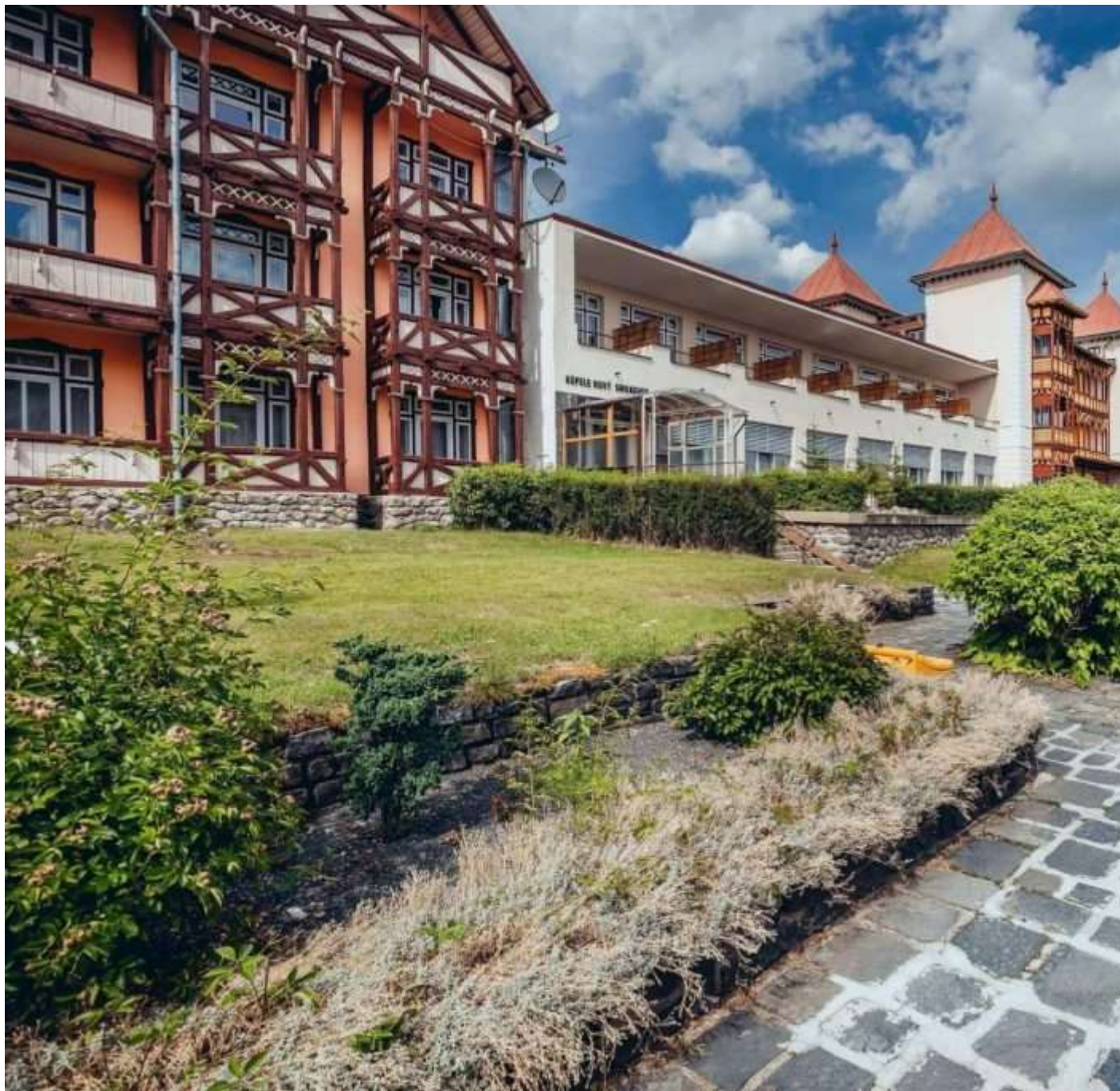
Nový Smokovec Spa