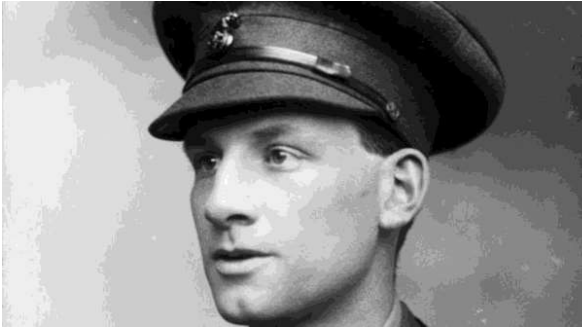
Siegfried Sassoon.

Soldier-poet Siegfried Sassoon was twice decorated for heroism and earned the nickname “Mad Jack” for his suicidal courage on the battlefield, but he was also one of the most impassioned critics of the savagery and waste of World War I.