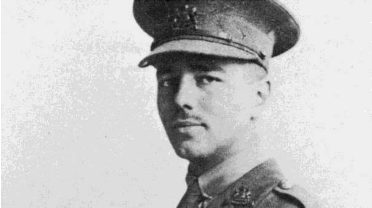
Wilfred Owen.

Wilfred Owen only published five poems during his lifetime, but his harrowing descriptions of combat have since made him into one of the towering figures of WW1 literature. Just 21 years old when the war broke out, he enlisted in the British army in 1915 and later took part in heavy fighting in France. “I have not been at the front,” he wrote his mother. “I have been in front of it.” After being diagnosed with shellshock in 1917, Owen was sent to convalesce at a hospital in Scotland.