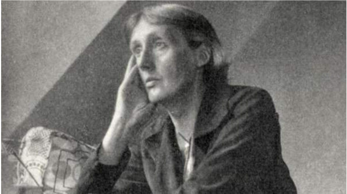
Virginia Woolf.

Virginia Woolf , who had been a close friend of the fallen poet Rupert Brooke , wove profound references to the war's effects throughout her works. In the setting of her acclaimed novel Mrs. Dalloway , the war has ended, but everyone remains deeply affected by it, including one of the novel's main characters, a veteran with severe shell shock (now known as post-traumatic stress disorder).