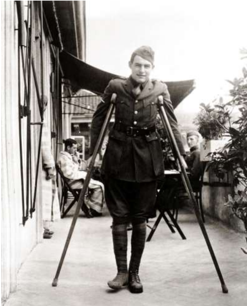
Ernest Hemingway in Italy, April 1919, after being seriously wounded during World War I.

In one of the most famous works, set during the WW1 American writer Ernest Hemingway offers a gripping love story between a soldier and a nurse set against the chaotic, stark backdrop of World War I. A Farewell to Arms is among the writer's most autobiographical: Hemingway himself served as an ambulance driver during the war, was severely wounded on the Austro-Italian front and had been sent to a hospital in Milan, where he fell in love with a nurse.