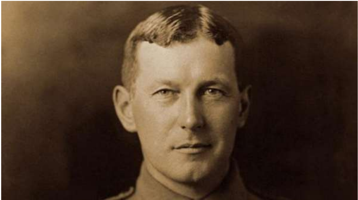
John McCrae.

A doctor by trade, Canada's John McCrae volunteered for WW1 in 1914 and served as a brigade surgeon for an artillery unit. The following year, he had a front row seat to the horrors of the Second Battle of Ypres, where the Germans launched an assault that included the war's first use of poisonous chlorine gas.